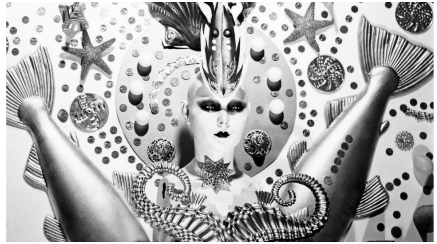
STEVEN ARNOLD - HEAVENLY BODIES (film still) - Vishnu Dass Courtesy Galerie FAHEY/KLEIN Los Angeles

Paris, 23 October 2019 - For its 23rd edition, Paris Photo, the largest international art fair dedicated to the photographic medium, announces programming for the 3<sup>rd</sup> edition of the Film sector. The film sector highlights the relationship between still and moving images in artistic creation with a selection of documentaries and fiction projects featuring artists exhibiting at the fair and films the collections of the Centre national des arts plastiques (Cnap). The film sector is curated conjointly by Matthieu Orléan, Artistic Advisor at the Cinémathèque française, and Pascale Cassagnau, Head of Audiovisual Collections and New Media, Cnap.