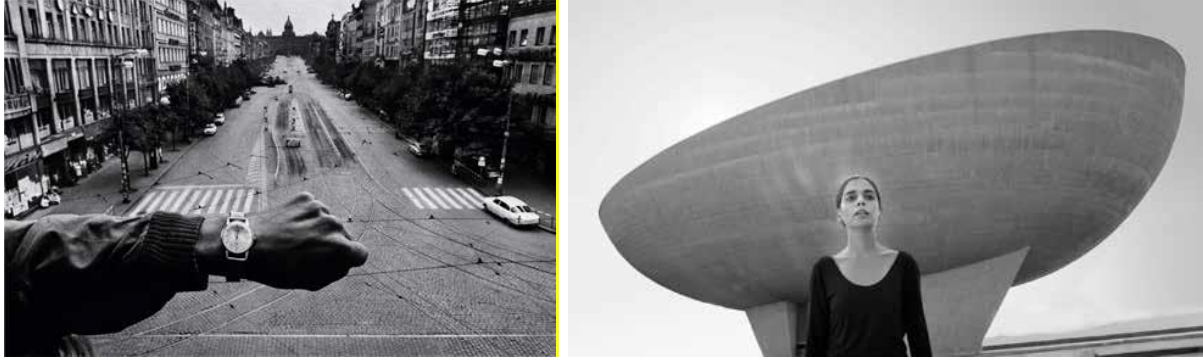
INVASION, GYPSIES, CHAOS (film still), Josef Koudelka, 2002 (36'), ROJA (film still), Shirin Neshat, 2016 (17')